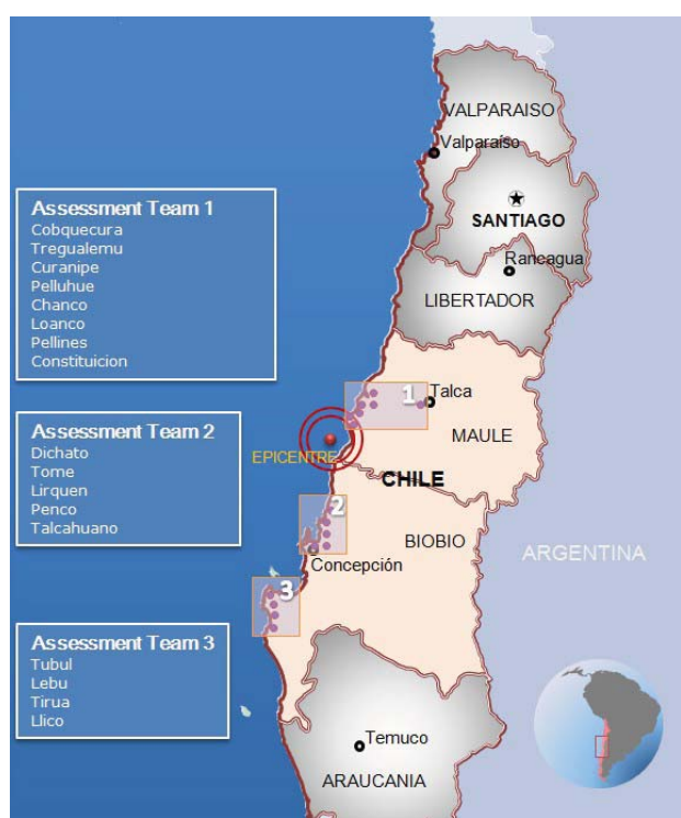
Map representing the areas where interagency assessment missions were carried out between 8 and 9 March.