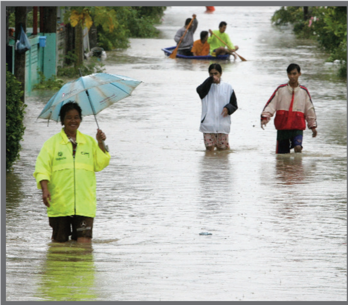
Thai residents walk on a flooded street in the Chon Buri province, about 81 km (50 miles) east of Bangkok, September 14, 2005. The weather bureau warned that the depression from the east coast of Vietnam could cause flooding in some areas of Thailand.

In each example above, the V&A approach is used in a different way. V&A can be incorporated at any stage of the project cycle and tailored to meet the specific needs of the project. The complete six-step V&A approach is most easily incorporated into USAID projects at the initial stage of the project cycle but is flexible enough to be applied at different stages of the project cycle and using only those V&A steps required by the project.