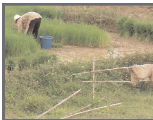
Wet season rice cultivation: In the Lower Songkram River Basin in Northeast Thailand, livelihoods are adapted to seasonal flooding (IUCN, 2006)

Climate may impact projects and programs in a variety of sectors and operational areas. A cursory review of the U.S. Foreign Assistance Guidance on Operational Plans suggests that all five Objective Areas could feature projects and programs potentially impacted by climate (see Exhibit 4 on p. 5).